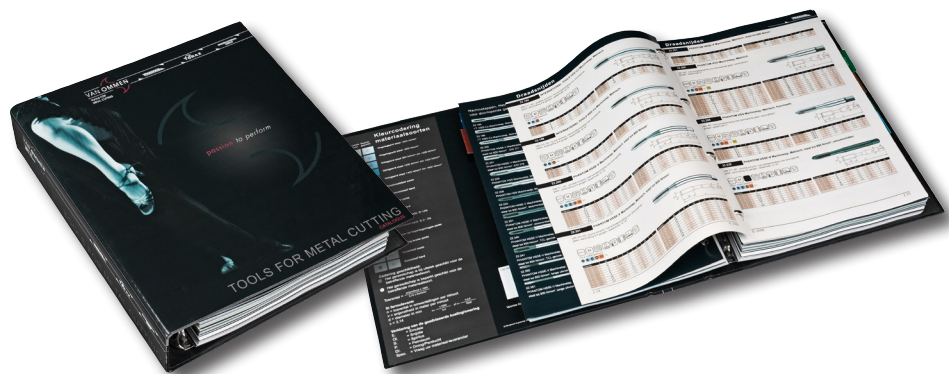
Van Ommen's enormous catalog containing information about 25.000 different products is created in several language variations managed by Perfon