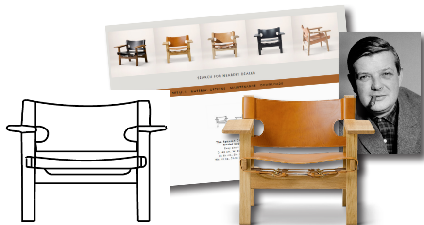
On Fredericia's website, all product information, line drawings, product images and related information are delivered directly from the Perfon PIM system

By switching to Perfon, the company has also optimized its work processes: With branches on several locations it is a great advantage that employees now have access to the same information in one single system, in which they can all work at the same time.